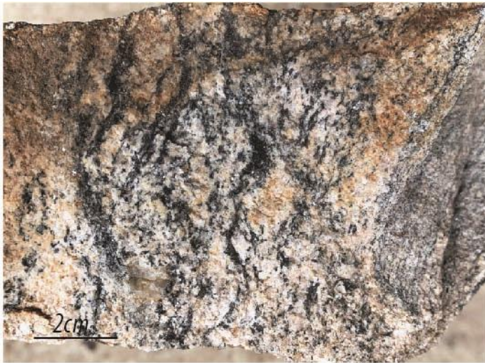
Photograph of sample 2016087.