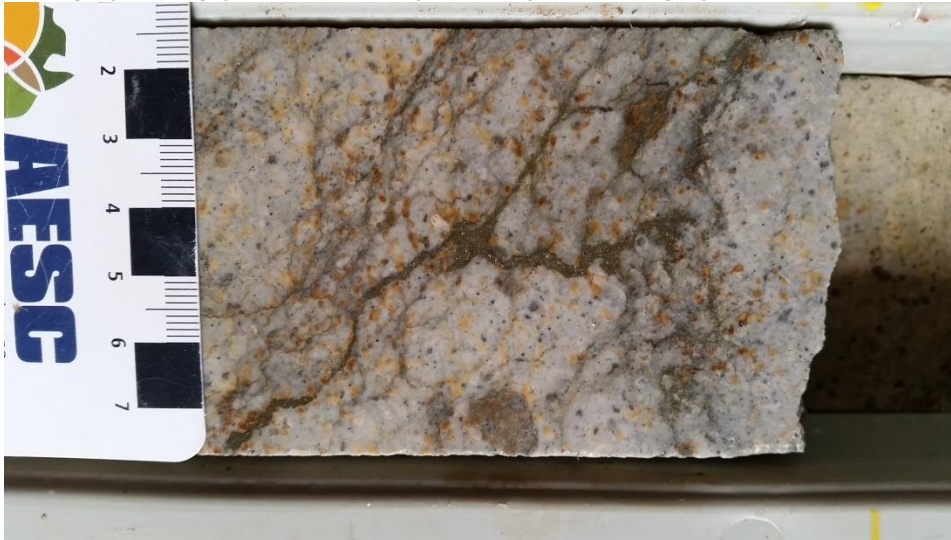
HAND-SPECIMEN IMAGE OF WRDD026 99.7

Photograph(s) e.g. field site, hand-specimen, photomicrograph: